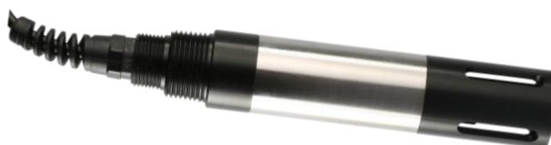
Dissolved Oxygen Sensor (Replaceable membrane head)